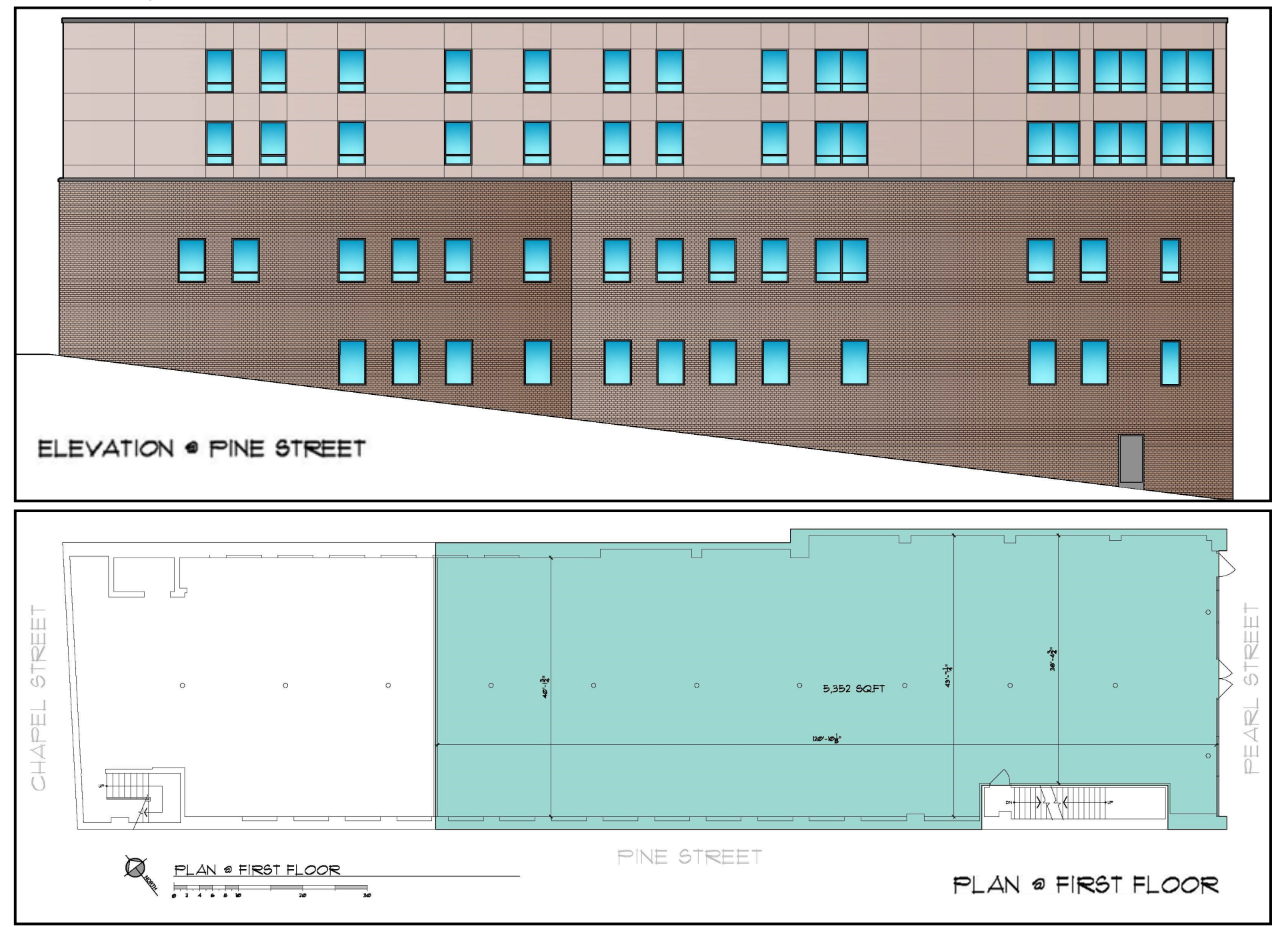
FOR LEASE 48 N Pearl St, Albany, NY 12207